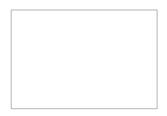
Figure 1. Example of caption. It is set in Roman so that mathematics (always set in Roman: B \sin A = A \sin B ) may be included without an ugly clash.

"et" is a complete word.) However, use it only when there are three or more authors. Thus, the following is correct: "Frobnication has been trendy lately. It was introduced by Alpher [1], and subsequently developed by Alpher and Fotheringham-Smythe [2], and Alpher et al. [3]."